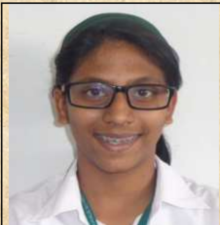
M V SAMPRITI (94.6%)